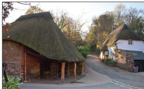
The Forge at Cockington is one of the most photographed buildings in the country and dates from the 14th century.