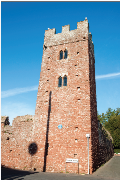
The Coverdale Tower is adjacent to the Paignton Parish Church and is named after Bishop Miles Coverdale who published an English translation of the Bible in 1536.