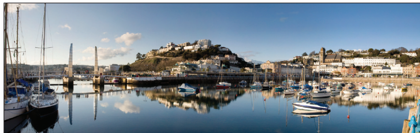
Torquay inner harbour tranquillity.