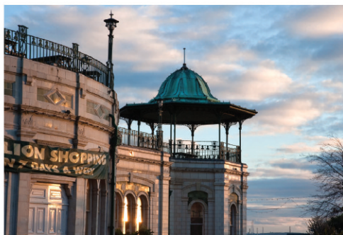
Evening light cast on the striking white tiles and copper roofing of Torquay Pavilion.

Torquay Pavilion and the fountain in the attractive gardens opposite. The Pavilion opened in 1912 as a 'Palace of Pleasure' to attract visitors to Torquay. It was used for music and plays, and as a meeting place. It is one of the best remaining examples of Victorian seaside architecture and was designed by Major Henry Augustus Garrett. It was not built on the site, as many pavilions were, but adjoining it. It was originally called 'The Cucumber House' when it was being built in 1909 and became known as 'The White Palace' due to its white exterior tiles which were made by Royal Doulton. The original cost of building the pavilion was £16942 4s 4d. It currently houses a unique collection of specialty shops and galleries.