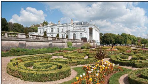
Oldway mansion and the gardens looking resplendent in late Summer.