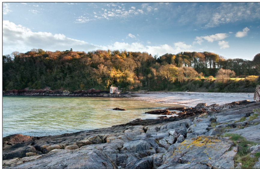
Elberry Cove in Paignton is surrounded by lovely woodland walks. Next to the cove sits the ruin of the Bath House which is visible in the centre of the picture. It was built for Lord Churston in the 1700s.